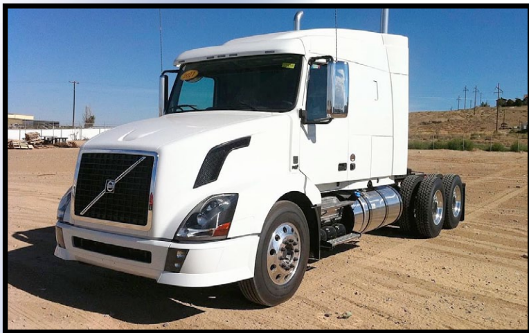
NEW 2011 VOLVO VNL64T630 Volvo Engine, D13, 500 HP, 13 Spd, Air Ride Suspension, 3.55 Ratio, 225" WB, 24.5LP Tires, All Alum Wheels, 3.2 CU FT Refrigerator. Stk #: 23914 ..... $116,790 Price Includes FET

Bruckner's is proud to be a part of Volvo Trucks North America Stop by your nearest Bruckner's location and test drive one today or ask about our demo program!