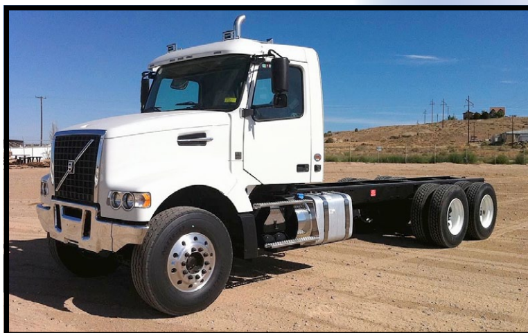
NEW 2012 VOLVO VHD64F200 Volvo Engine, D13, 500 HP, 10 Spd, T-Ride Suspension, 252" WB, 315/80R22.5 Front 11R24.5 Rear Tires, Alum/Steel Wheels, 20,000 # FA, 46,000 # RA, Heavy spec. Stk #: 25051. .... $124,089 Price Includes FET