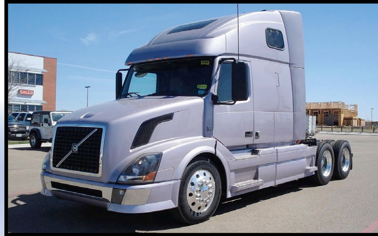
2008 VOLVO VNL64T670 Volvo Engine, D13, 485 HP, Engine Brake, I-Shift 12 Spd Automated Trans, Air Ride Suspension, 3.21 Ratio, 207" WB, All Aluminum Wheels, Hi Rise Sleeper, 12,500 # FA, 38,000 # RA, 530,007 miles. Stk #: 9095 ..... $63,500 Amarillo