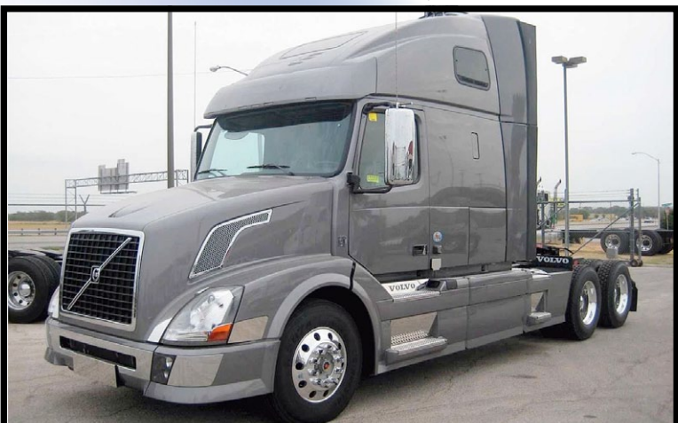
NEW 2012 VOLVO VNL64T670 Volvo Engine, D13, 500 HP, Engine Brake, I-Shift 12 Spd Automated, Air Ride Susp, 3.08 Ratio, 231" WB, 295/75R22.5 Tires, All Aluminum Wheels, 13,200 # FA, 40,000 # RA, Double bunk sleeper with convertible workstation. Refridgerator/freezer. Stk #: 25595 ..... $130,804 Price includes FET