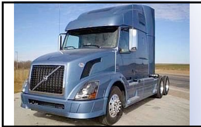
NEW 2011 VOLVO VNL64T670 Volvo Engine, D13, 475 HP, 13 Spd, Air Ride Susp, 3.42 Ratio, 221" WB, 22.5 Tires, All Alum Wheels, 12,000 # FA, 40,000 # RA, Premium Sleeper Controls, 1.6 CU FT Refridgerator. Stk #: 23948 ..... $116,121 Price Includes FET