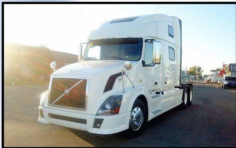
NEW 2012 VOLVO VNL64T780 Volvo Engine, D13, 435 HP, Engine Brake, I-Shift 12 Spd Auto, Air Ride Susp, 2.47 Ratio, 229" WB, 295/75R22.5 Front 295/75R22.5 Rear Tires, All Alum Wheels, 77" Hi Rise Sleeper, 13,200 # FA, 40,000 # RA, This is a Fuel Sipping Machine! Stk #: 25672 ..... $127,280 Price Includes FET