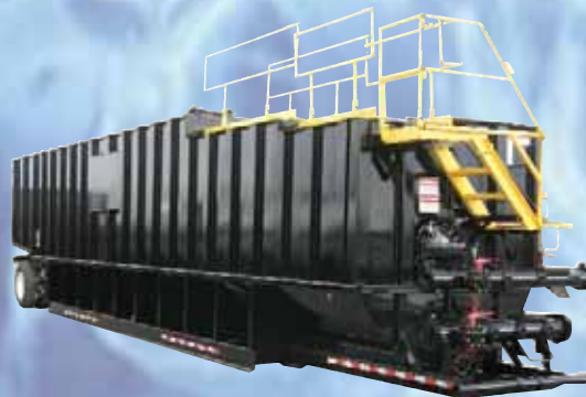
ROUND BOTTOM DUAL MANIFOLD FRAC TANK