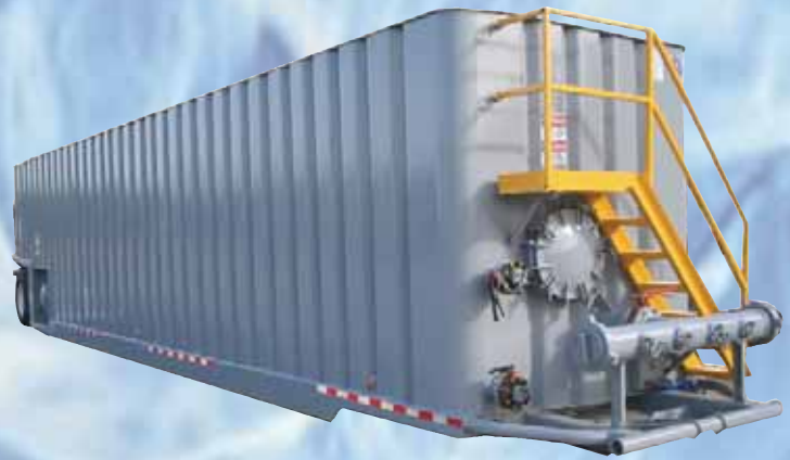
CORRUGATED WALL FRAC TANKS