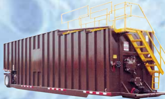
SMOOTH WALL SIDE V-BOTTOM CORRUGATED WALL FRAC TANKS