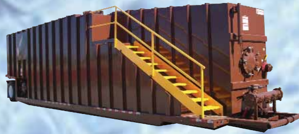
SMOOTH WALL SIDE ACCESS CORRUGATED WALL FRAC TANKS